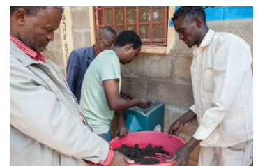
Washed sand goes in