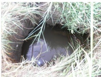
Current water source