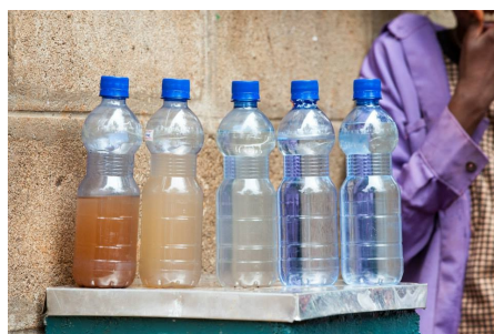
Before and after.