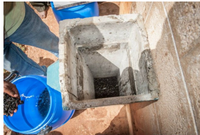
Bottom of the filter