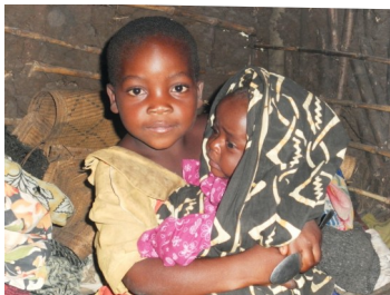
Toddler with a baby from DRC Congo

The funds raised at the Conference are going to be used to start a new BioSand Filter/community sanitation/hygiene program in a Batwa (Pygmy) community in Kahororo, DRC-Congo, between Uvira and Bujumbura, Burundi. This community has no source of clean water (their only well gave out almost a decade ago), and no latrines. Cholera, bilharzia, typhoid, bacterial dysentery, and amebiasis are common, and this community has among the highest child (under 5) mortality rates in the world. Two very enthusiastic initiators of the project have already been trained, and, with funds raised by WSEHA, all necessary equipment and starter material will be provided. Thanks to all who made this possible!