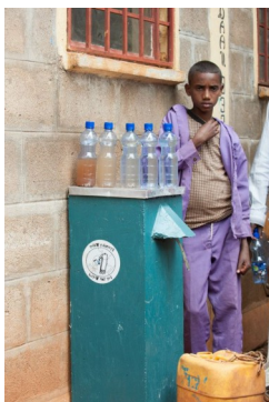
The water is getting clean.