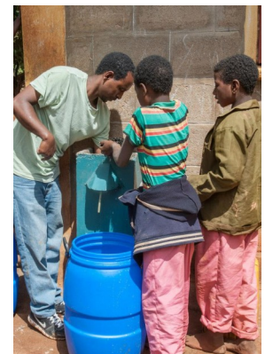
Helping with installation