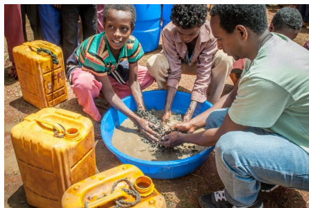
Abraham and boys washing sand.