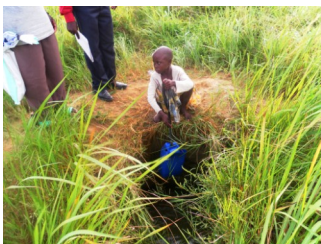
Water from hole