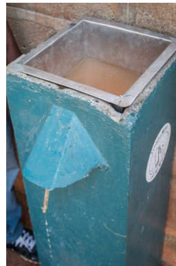
Diffuser box on top