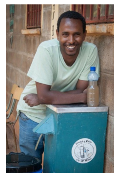
Job is done