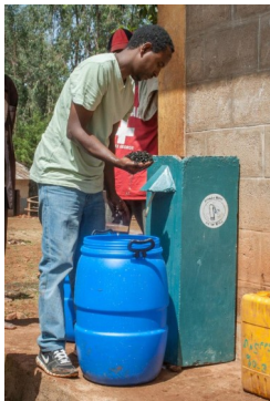
Putting the washed gravel in the bottom of the filter