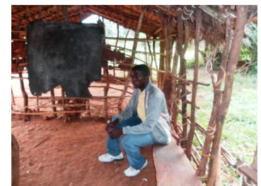
Man in cowshed